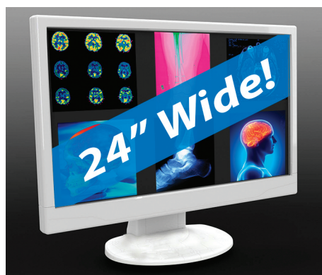
Stand shown for display purposes only