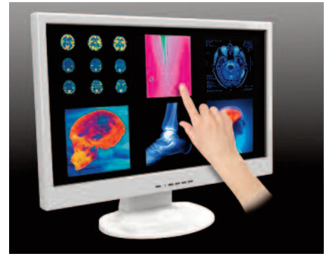
Stand shown for display purposes only